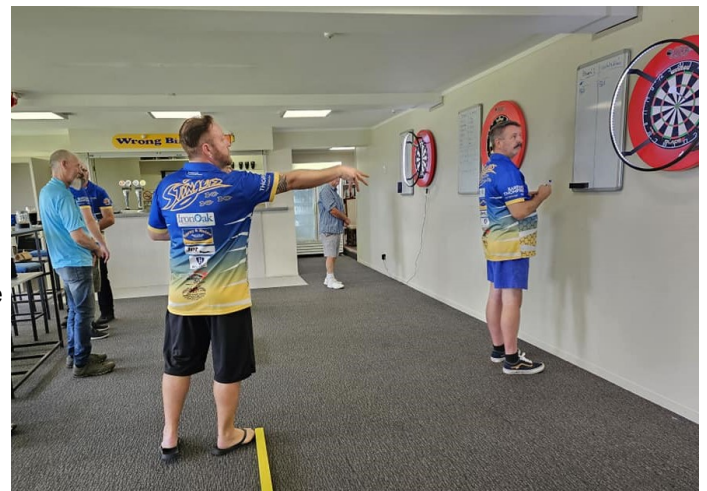
The scene of the 'A' grade win. The yet to be completed, but used last Saturday. downstairs darts setup.